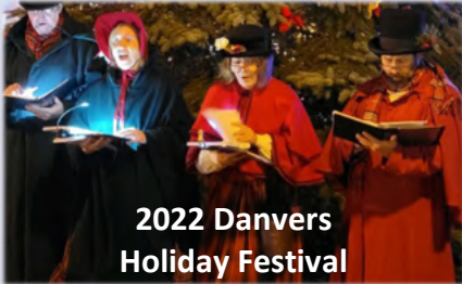
2022 Danvers Holiday Festival