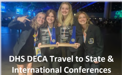
DHS DECA Travel to State & International Conferences