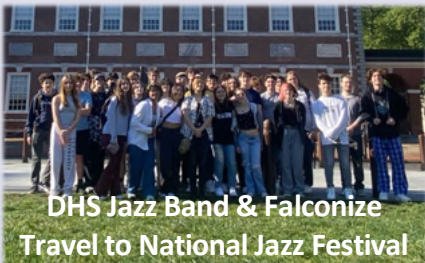
DHS Jazz Band & Falconize Travel to National Jazz Festival