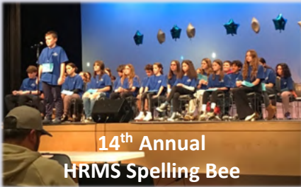
14 th Annual HRMS Spelling Bee