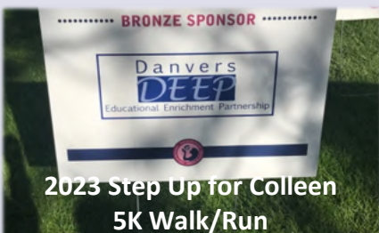
2023 Step Up for Colleen 5K Walk/Run