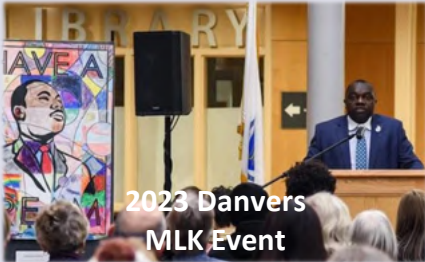
2023 Danvers MLK Event